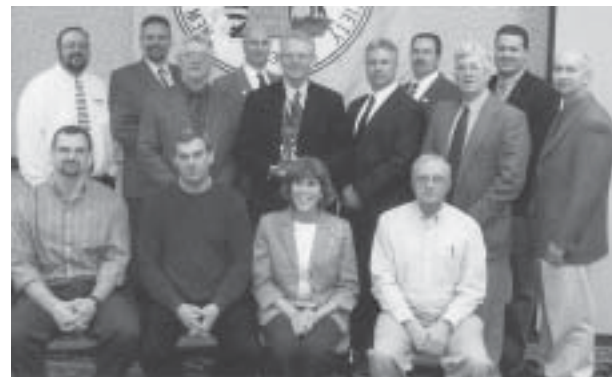
The I.L. Richer Company Team

A company that strongly supports New York agriculture, I.L. Richer is a founding member of the New York Agri-Development Corporation. Key staff members also serve and participate in LEAD New York, the FarmNet board of directors, the 4-H Foundation, NBT Bank's board of directors and the Morrisville College Foundation Board.