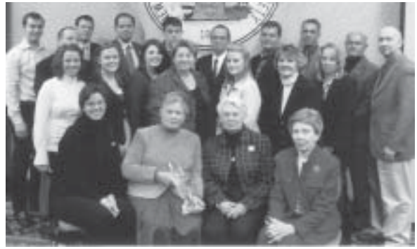
The Noblehurst Farms Team

Active in their community and the agricultural industry, Noblehurst Farms' shareholders are involved in and support numerous local and statewide boards and industry groups. Throughout the generations, the owners and employees of Noblehurst Farms have had a positive influence on their community and industry. They are a model for business collaboration and long-term success.