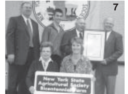
Cochrane Farms (3) Ripley, NY Chautauqua County -Cochrane/Chess Family-