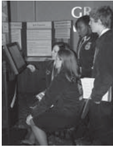
Students from Tri-Valley FFA "Chapter of the Year"

when it received the National FFA Chapter Award for community, chapter and student development.